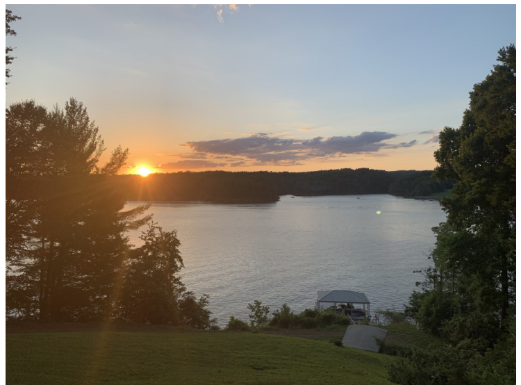
Sunset from the Koontz Family deck in Wilkesboro, NC. (Do you think they will let us spend the rest of our quarantine time with them? LOL)

Q: How does a hurricane see? A: With its eye.