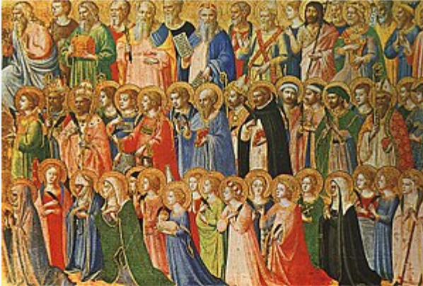
Painting of various saints by Fra Angelico