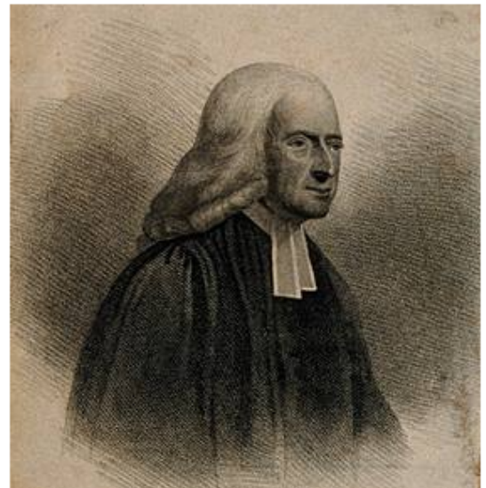
John Wesley was fond of All Saints Day.

In an All Saints Day journal entry dated Monday, November 1, 1756, Wesley writes, "How superstitious are they who scruple giving God solemn thanks for the lives and deaths of his saints!" If your 18 th century English is as rusty as mine, it might help to know that the word scruple means not doing something because you think it's wrong.